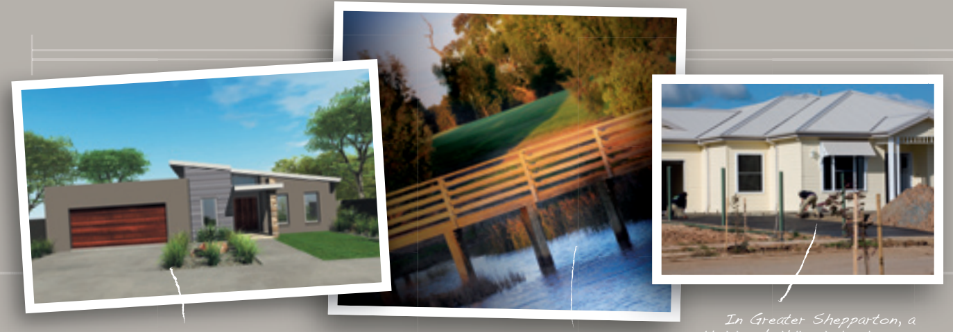
This is what $385,00 buys you in Shepparton - 4 minutes from the centre of town, 4 minutes from one of the states best ranked schools, and 2 minutes from a golf course!

Whether you choose to live in central Shepparton, or one of the beautiful satellite towns such as Murchison, Tatura, Mooroopna or Dookie, there's bound to be a lifestyle choice that's perfect for you.